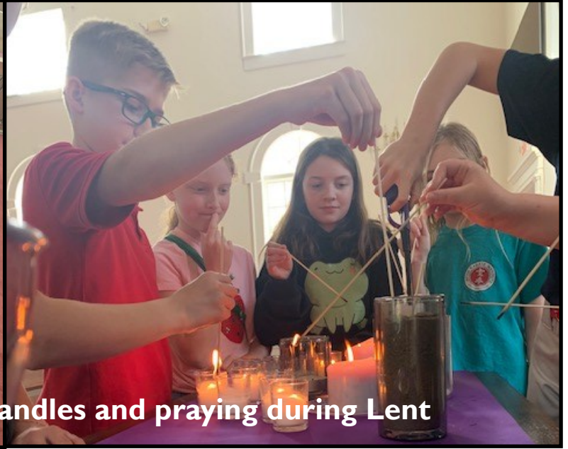
LOGOS children lighting candles and praying during Lent