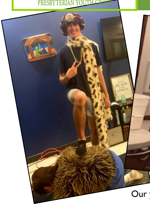
Our youth acting out stories from 1 & 2 Kings.

Making disciples of the next generation who reach UP to God, IN to one another, and OUT to the world!