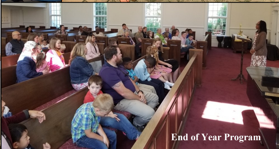
End of Year Program

Our Mission: Making disciples of the next generation who reach UP to God, IN to one another, and OUT to the world!