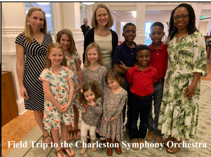
Field Trip to the Charleston Symphony Orchestra