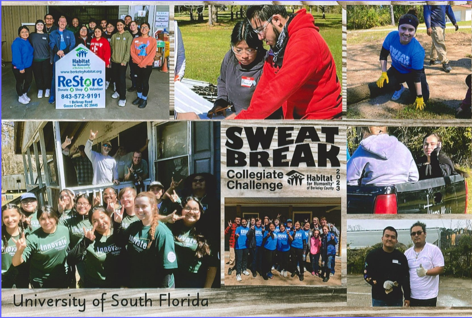
University of South Florida

We partnered with Berkeley Habitat and housed students in the Well from Fisher College and the University of South Florida. These students spent their spring break serving in our community. Thank you to everyone that provided meals, snacks, your smiling face and showed them Christian love and hospitality.